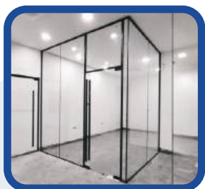
Aluminium Slim Profile